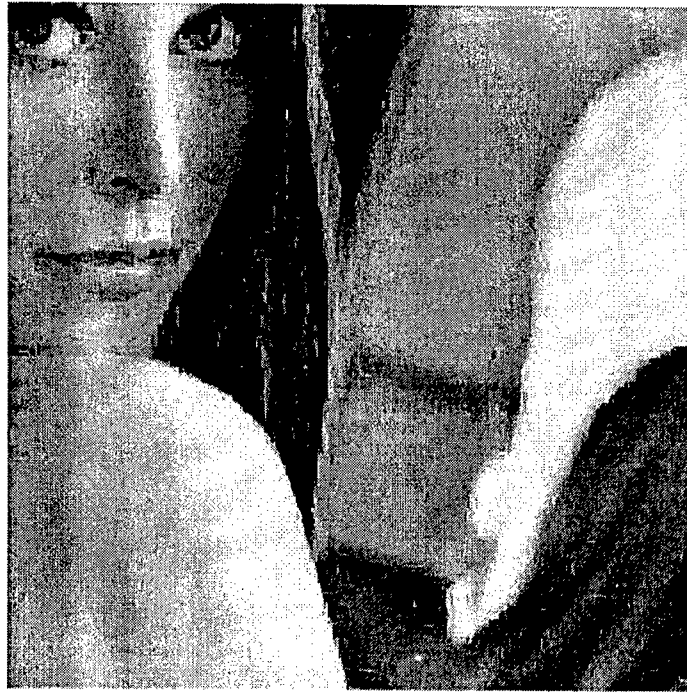
Figure 6: Four times magnified "Lena" Fractal technique