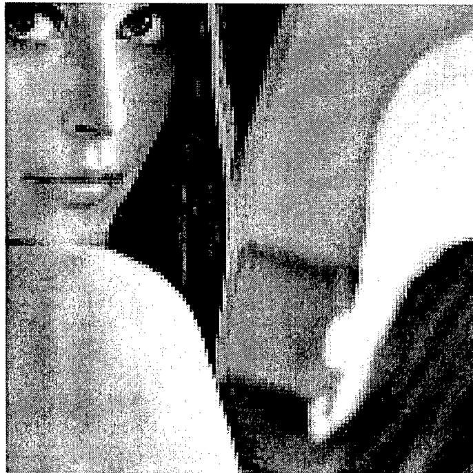
Figure 7: Four times magnified "Lena" using Nearest Neighbour