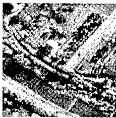
Figure 11: Decoded "LFA" image