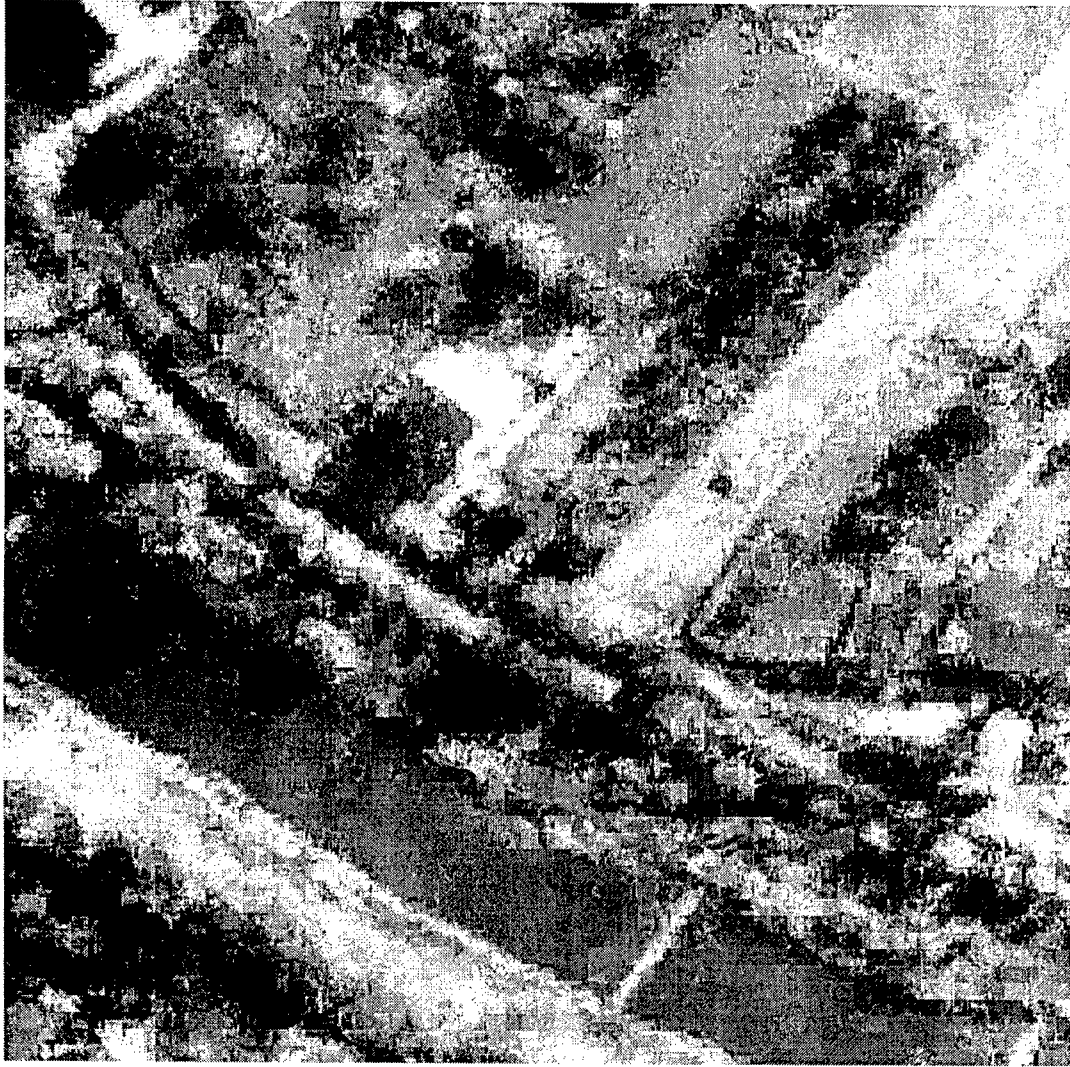
Figure 14: Eight times magnified "LFA" Fractal technique