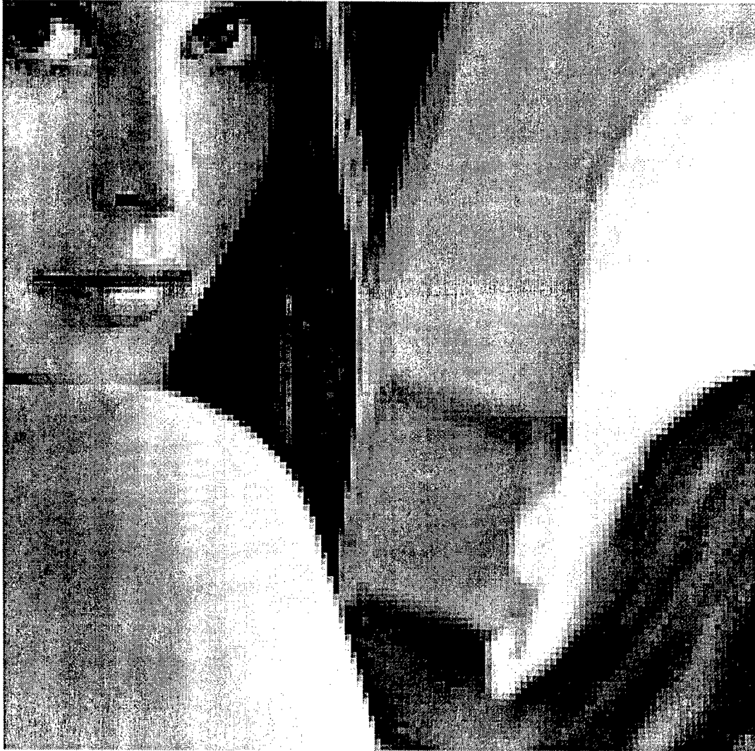
Figure 9: Eight times magnified "Lena" using Nearest Neighbour