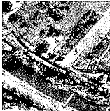
Figure 12: Two times magnified "LFA" using Fractal technique