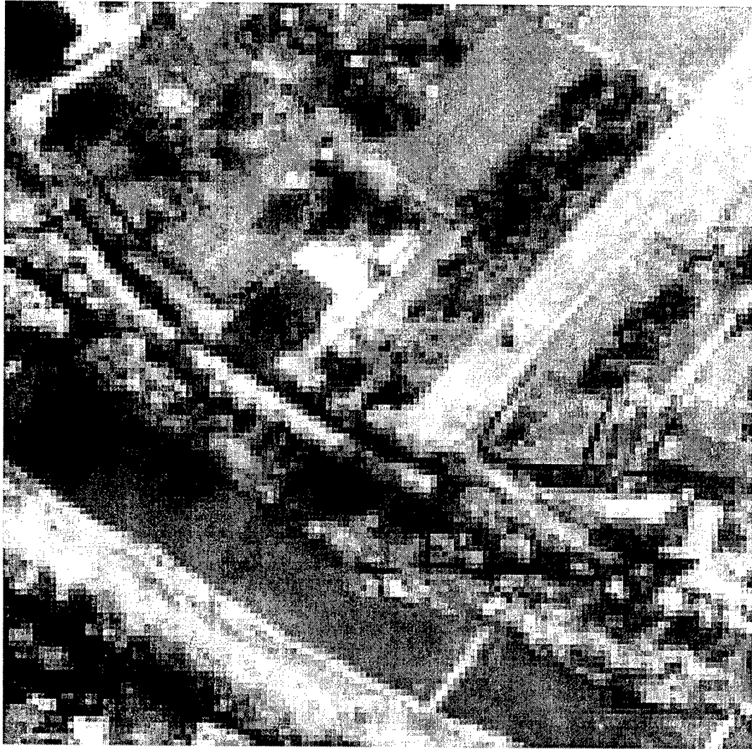
Figure 15: Eight times magnified "LFA" using Nearest Neighbour