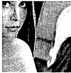
Figure 2: Original "Lena" image