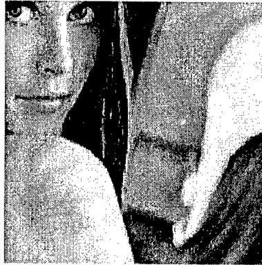
Figure 4: Two times magnified "Lena" using Fractal technique