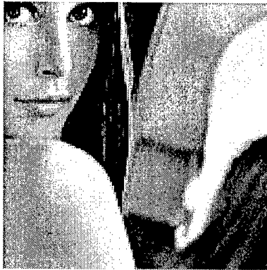
Figure 5: Two times magnified "Lena" using Nearest Neighbour