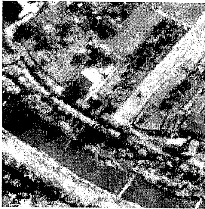
Figure 13: Four times magnified "LFA" Fractal technique

compression (in terms of compression ratio) can be achieved. To solve this problem one can think of quadtree partitioning of the images instead of square partitioning while generating the fractal codes [27]. Another scheme, to obtain the PIFS codes of an image, has been suggested by Thomas et al. [28] can also be adopted in this connection. In this scheme they have considered irregular shaped range blocks. Automatically the matched domain blocks are just the scaled and magnified versions of these irregular shaped range blocks.