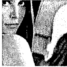
Figure 3: Decoded "Lena" image