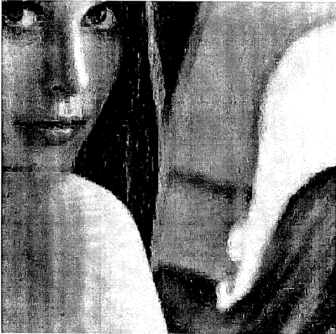
Figure 8: Eight times magnified "Lena" Fractal technique