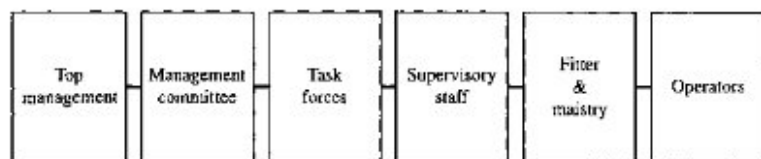
Figure 2. Teachers and participants.

force members. This process was continued until all the operators were trained, and is shown in Fig 2. Conducting the programme in this above manner helped all employees to understand: